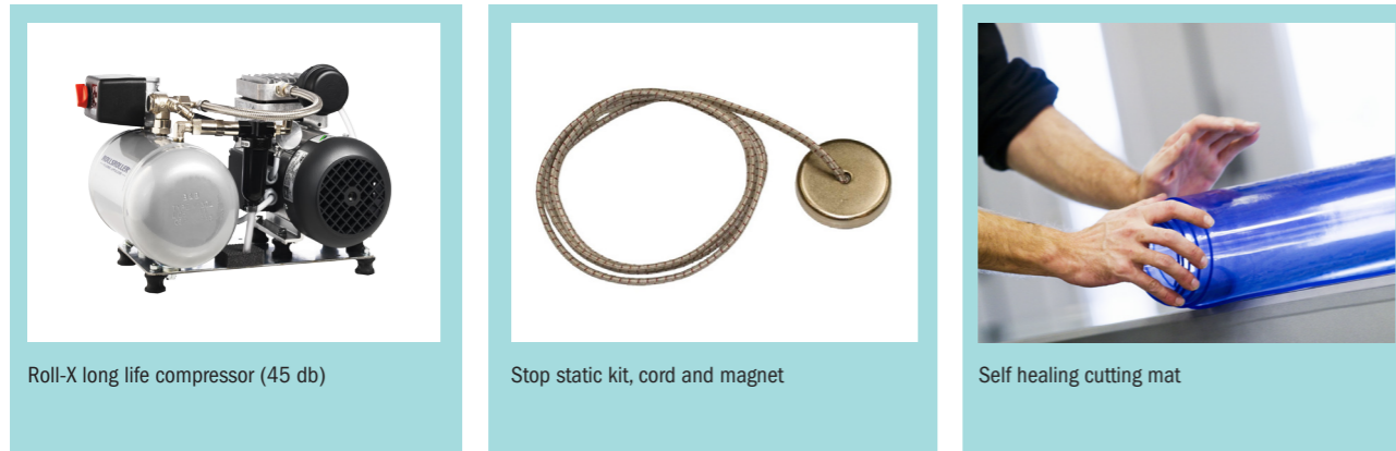
Roll-X long life compressor (45 db)

Great accessories to improve and modify your ROLL-X Flatbed Applicator. To make your job even easier, choose between many original accessories to improve your daily work.